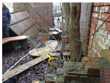
Photograph of the area before transformation.

Mrs Morgan and some of the children from year 4 have worked hard this year transforming an unused area next to the gym into a secret garden. They have planted tomatoes, courgettes and beans in one section and the other is a grassed area with flowers and seating suitable for story-time.