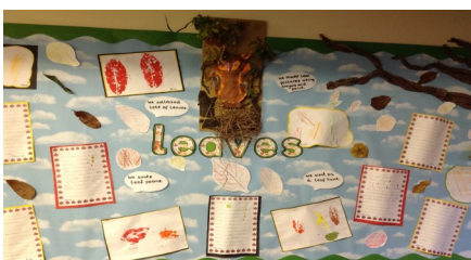
Y1—Autumn Leaves display/Animal home