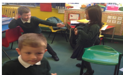
Y1—Toy Story Freeze Framing