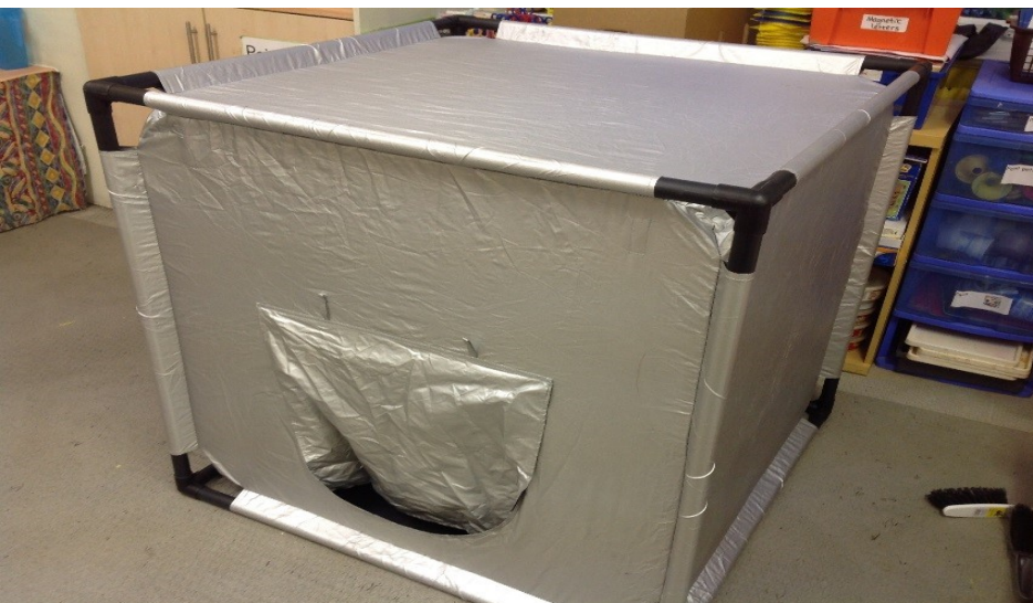
Year 1's 'Dark Tent'

In Year 2, children have been learning the traditional tale 'Jack and the Beanstalk'. They have been writing their own character descriptions of the giant and are currently working on writing their own diary entry for Jack's day.